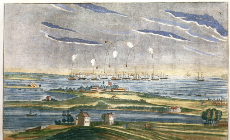
A VIEW of the BOMBARDMENT of Fort McHenry, near Baltimore, by the British fleet, taken from the Observatory since the entrance of Admiral Cochrane's fleet on the morning of the 13th of Sept. 1814, which lasted 24 hours & threw from 1200 to 1800 shells on the fort, which was defended with great gall.